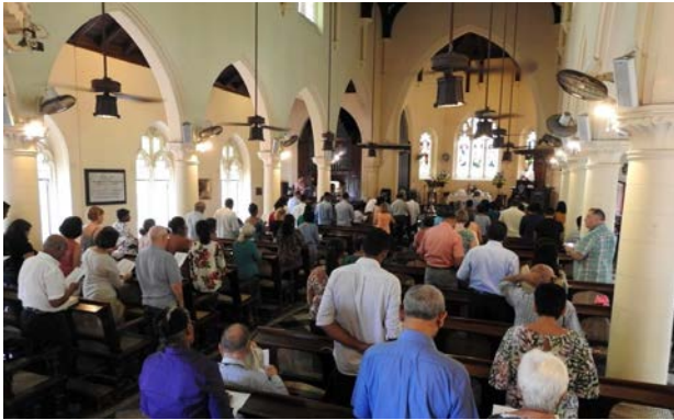
Worshippers at St Andrews Scots Kirk in Colombo, Sri Lanka, stayed to pray for those affected by the bombings on Easter Sunday