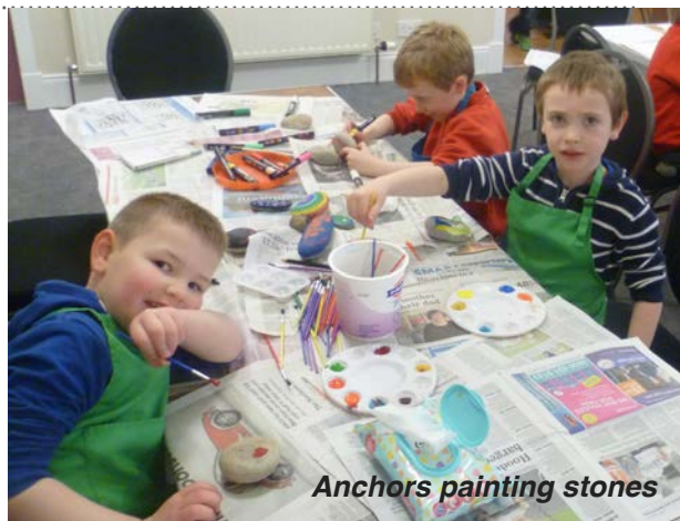
Anchors painting stones