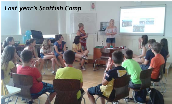
Last year's Scottish Camp

We are also hosting a Quiz Evening in the Rugby Club on Friday 7 June at 7.30pm. Please gather your teams together as I'm sure it will be a great evening. Let's see who are our best quizzers!