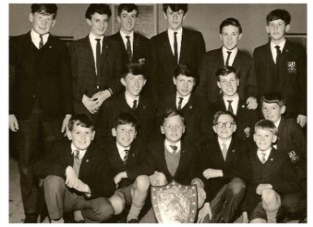
Kinross BB football team with the league trophy (1960s)