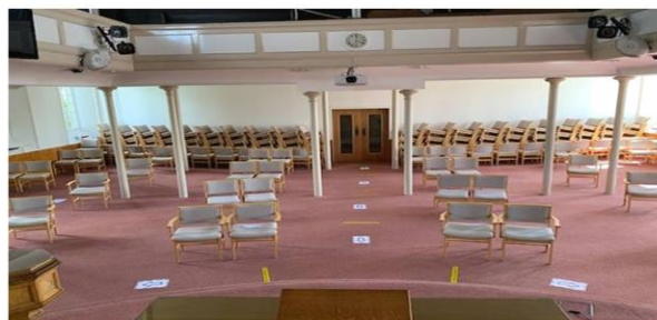
New seating arrangement at Kinross Parish Church

The layout of the church has been arranged according to social distancing requirements.