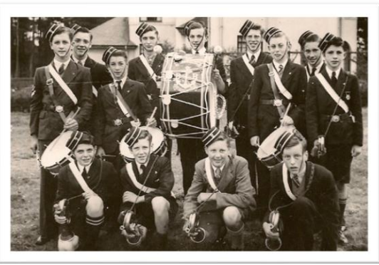
Kinross BB Bugle Band at Market Park (1950s)

Our 100th birthday celebrations are also on hold until limitations for large groups will be eased. Meantime we are still on the lookout for Kinross BB memorabilia in the form of photographs, newspaper articles, individual memories etc. If you have anything you would like to share, please contact me at d_g_munro@hotmail.com