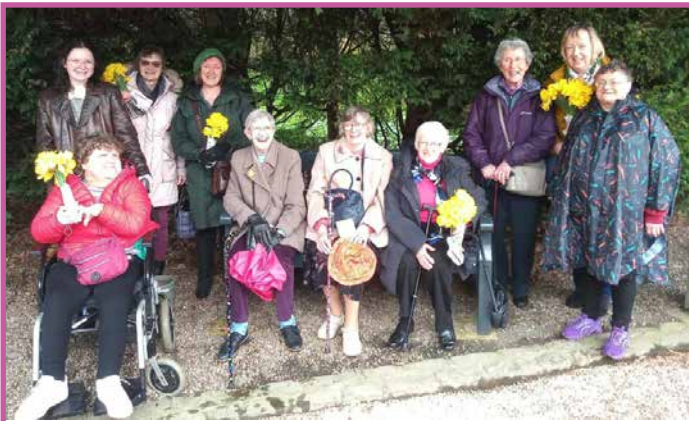
Table Talk - Zoom Chats and a Trip to Rossie Gardens