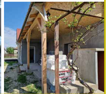
Below: Csongor shelter house