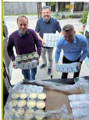
Left: Delivering food supplies in Csongor