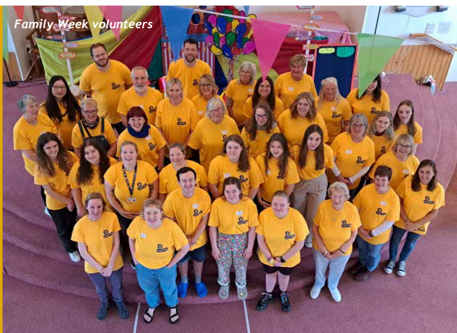
Family Week volunteers