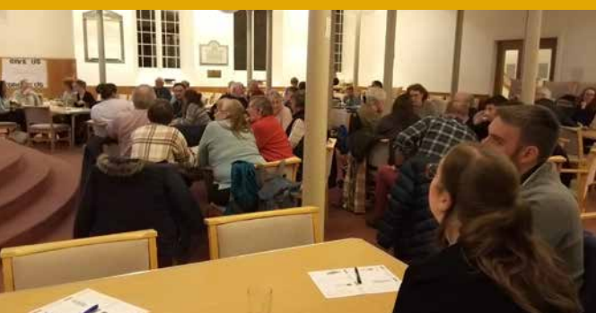
Tearfund Big Quiz Night

There is much to consider as we seek to build His Kingdom in Kinross-shire. If you have questions, comments or suggestions, please speak with the Minister or Session Clerk or email office@kinrossparishchurch.org as we welcome everyone's input.