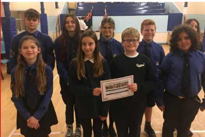
Top: Mission Aviation Fellowship fundraising certificate presentation; Below: 10-pin bowling