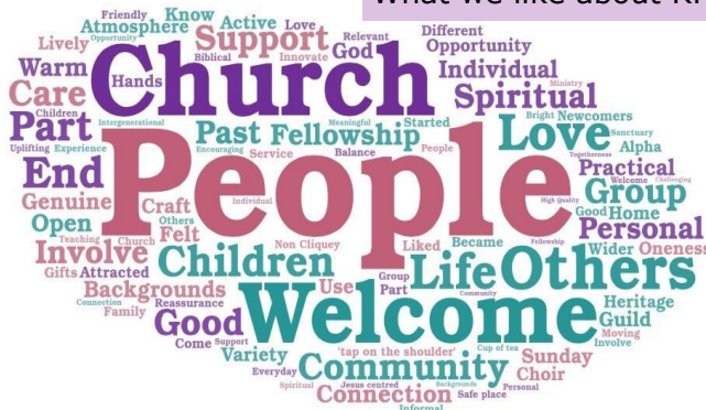
What we like about KPC