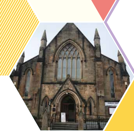
Kinross Church Centre

To sign up to our weekly email please contact our Church Office